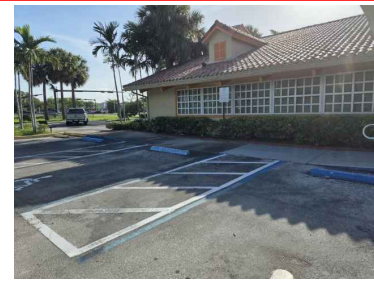
2100 West Atlantic Boulevard Pompano Beach, Florida

Point of Commencement NW corner Tract A Found 1/2 Pipe No ID